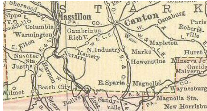
Figure 2. Detail of Stark and Tuscarawas counties 56